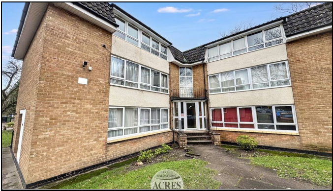
Limberlost Close, Birmingham, B20 2NU